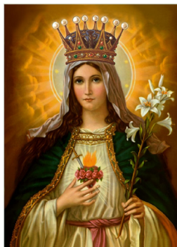
Queenship of Mary Novena Sign-up